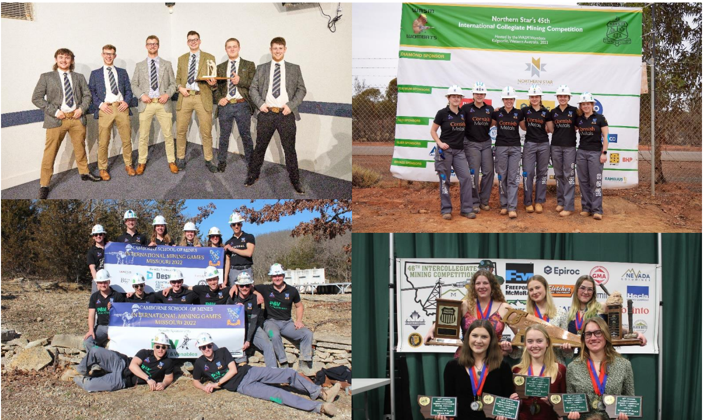
Previous CSM teams competing at Intercollegiate Mining Games

As well as the publicity and corporate social contributions you make, in return for your sponsorship, the team will be providing written reports and photographic journals from the event for your newsletters and other corporate advertisements. We will also provide you with copies of our media coverage. The exact nature of feedback and level of interaction between students and sponsors will be decided by you and can be either formal or informal. This can be discussed further before sponsorship is agreed upon.