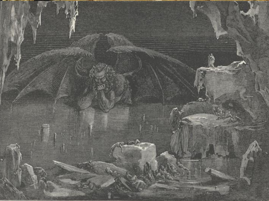
"Lo!" he exclaimed, "lo! Dis; and lo! the place Where thou hast need to arm thy heart with strength." Canto XXXIV, lines 20, 21.