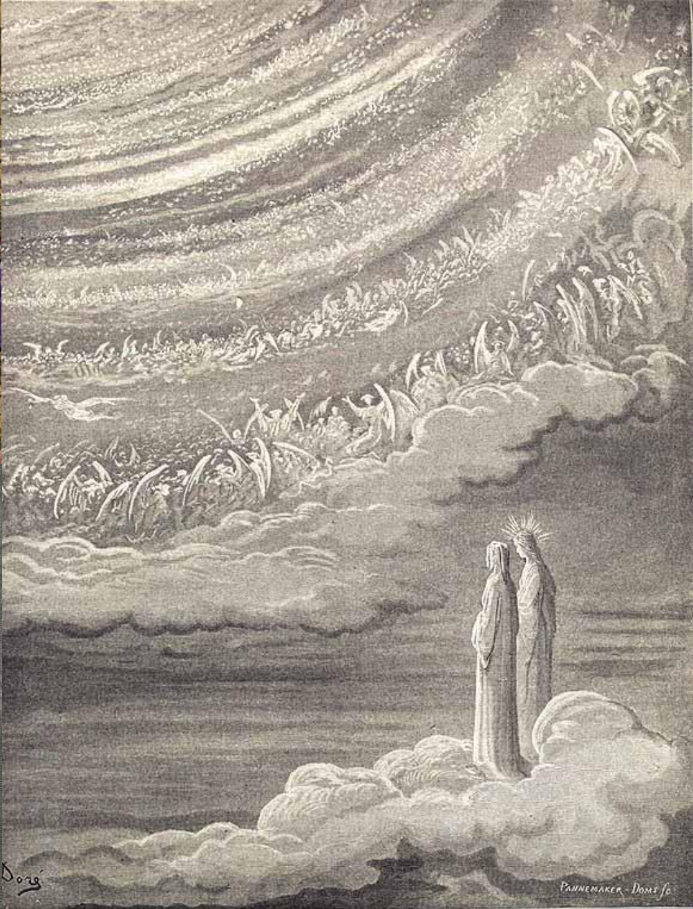
... NON ALTREMENTI FERRO DISFAVILLA CHE BOLLE, COME I CERCHI SFAVILLARO. Paradiso, c. XXVIII, v. 89 e 90.